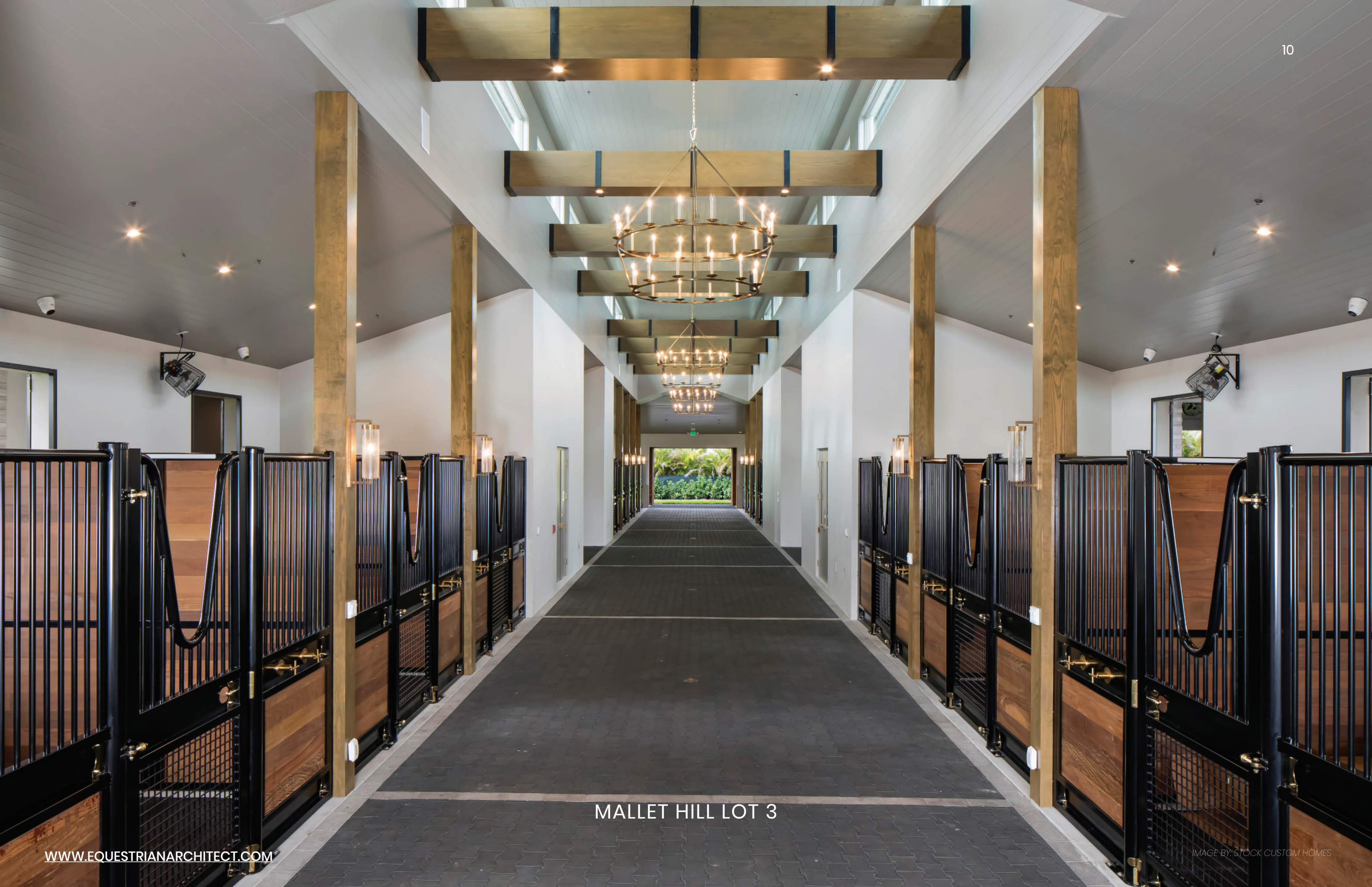
MALLET HILL LOT 3